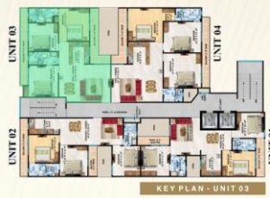
KEY PLAN - UNIT 03