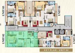
KEY PLAN - UNIT 02