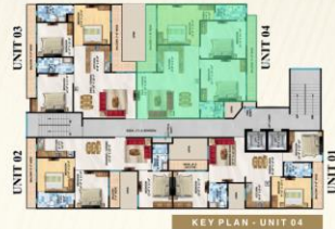
KEY PLAN - UNIT 04